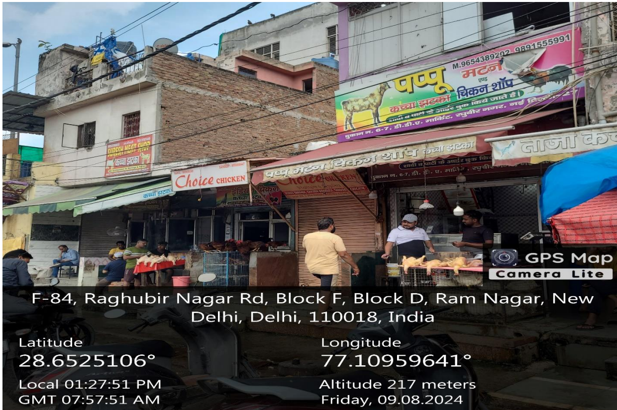
Fig: Nearby Butcher Shops and meat market about 650m away from dhalao